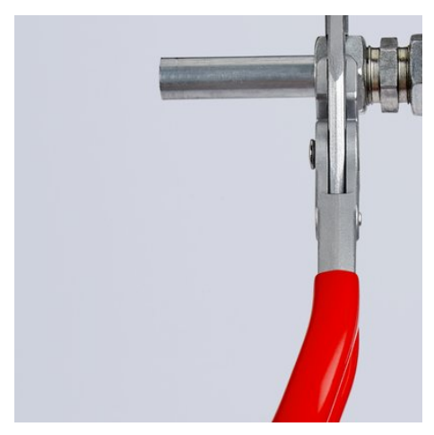
Angled handles for more room to grip